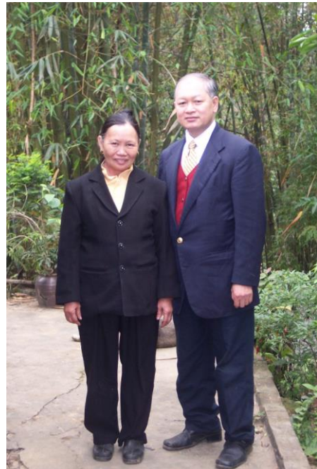
Leiz, Zanx-Liouh (Lei, Tzan Liou) caux ninh nyei auv, zoux jiu-baang bieiv nzuonx seix leih maiv go 2010 wuov hnyangx.