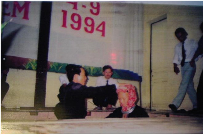
'Sieqv dorn jiex wuom nyei leiz, yiem Lang Son Saengv, 1994 wuov douc hnyangx daauh.