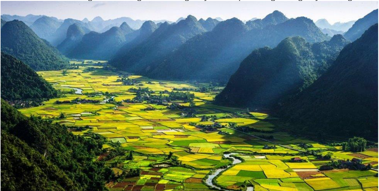
Naaiv se ih jaax hnoi Bac Son nyei lingh baengh. Daauh baan sienx Yesu nyei mienh caux ih jaax hnoi sienx nyei mienh corc yiem naaiv buoqv mbong nyei.

Yiem 1942 taux 1950, hietc hnyangx nyei dorngx, cuotv domh wuon-baengc hoic wuov deix buonv-deic dorngx mienh gamh nziex haic. Maaih mienh camv naaic, "Mbuo gan haaix diuh jauv gauh longx orqv? Sienx Yesu gauh longx fai zaangc mienv gauh longx?" Wuon-baengc faaux taux m'ngorngv-famv nor mienh camv gorngv naaiv se weic mienv muoqv oix zuqc gaanv deix sipv mienv cingx daaih haih longx hnangv. Yiem naaic daaih maiv maaih haaix dauh yiem Tran Yen laangz daaih sienx Yesu. Zoux gau kungx nduqc buonc mienh