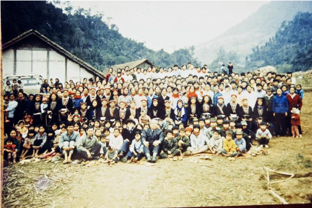
Daauh norm lu-Mienh Jiu-baang yiem Lang Son Saengv, Janx-Zei Guoqv, 1940 hnyangx-daaub. Naaiv fangx biux mengh Jiu-baang se yiem zuqc mbong zaangc nyei dorngx.