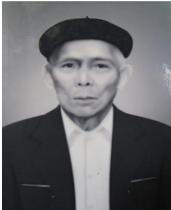
Loz-hnoi sienx Yesu mienh, benx Leiz, Tzan Liouh nyei die.